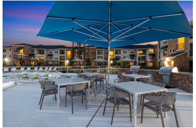
34 of 36