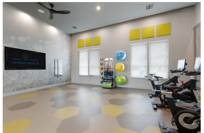
30 of 36