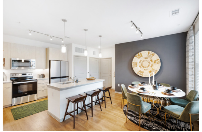
8 of 36