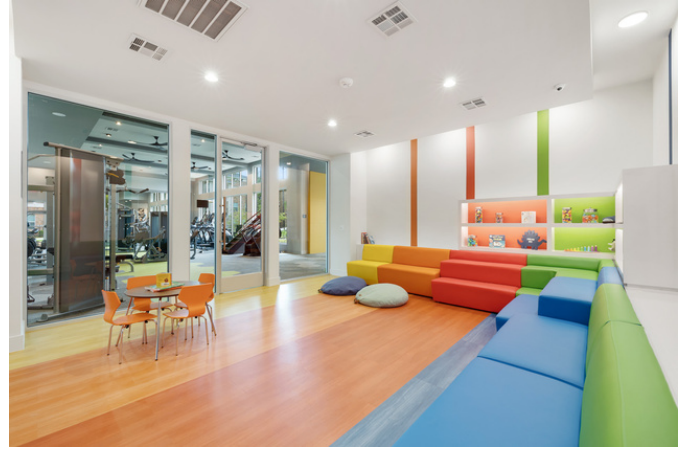
26 of 36