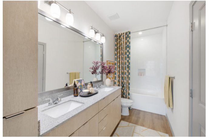
14 of 36