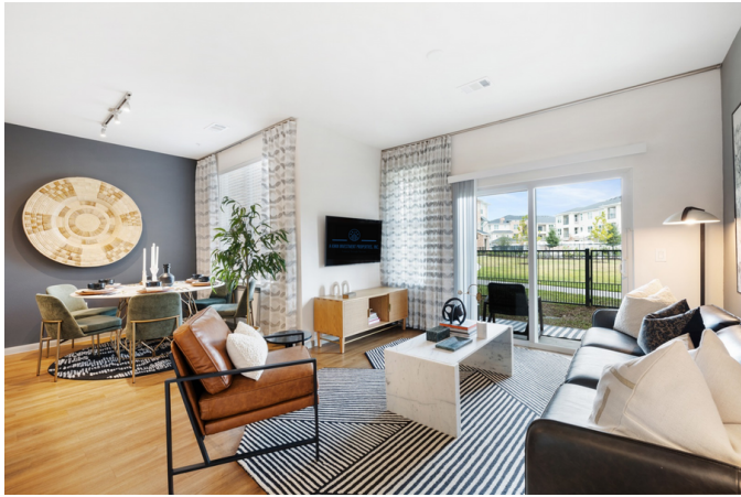
9 of 36