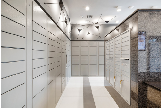
27 of 36