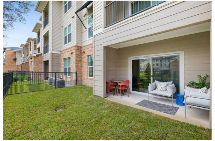
20 of 36