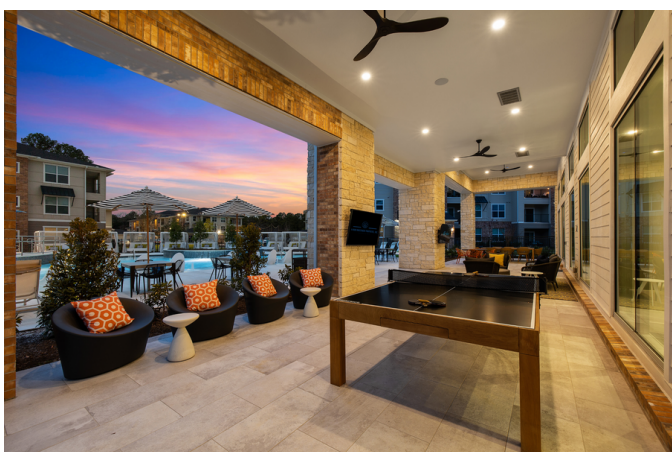
3 of 36