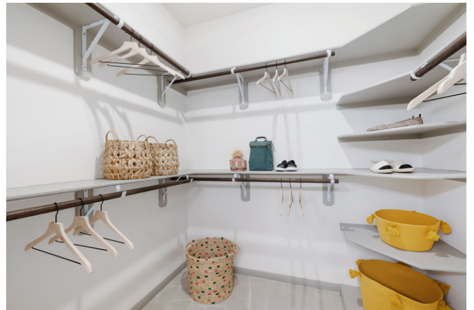
16 of 36