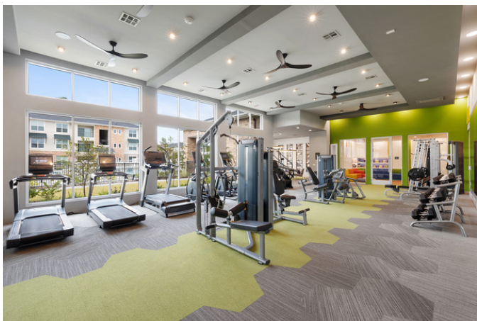
23 of 36