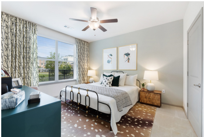
15 of 36