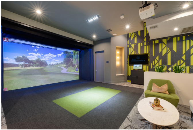
21 of 36