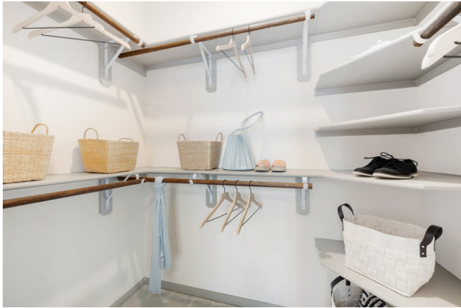
13 of 36