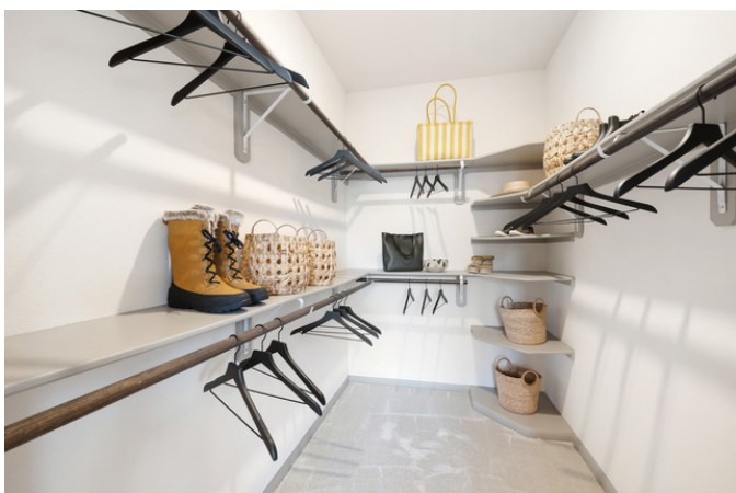
5 of 36