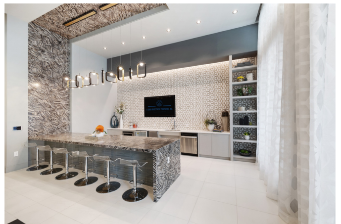
24 of 36