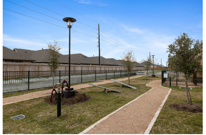
32 of 36