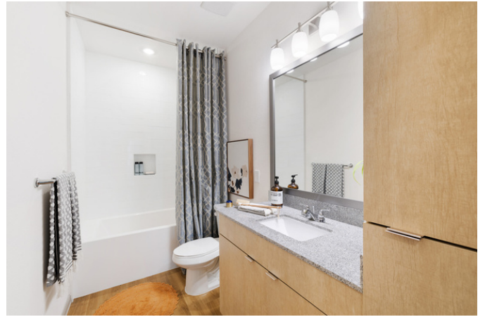
10 of 36