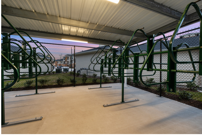
31 of 36