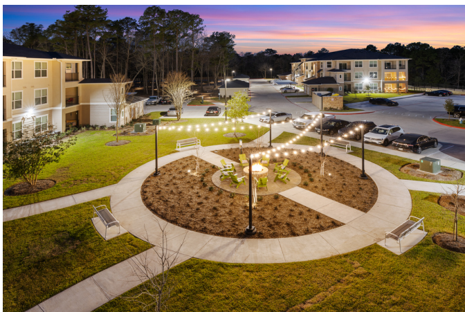
35 of 36