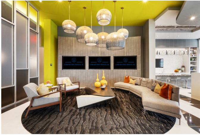
19 of 36