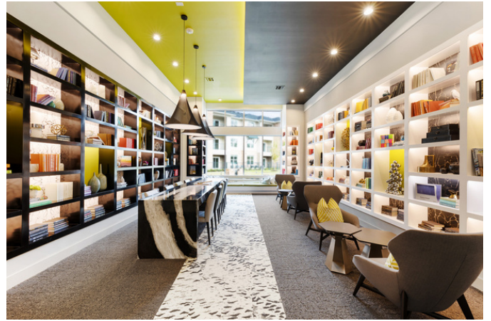
28 of 36