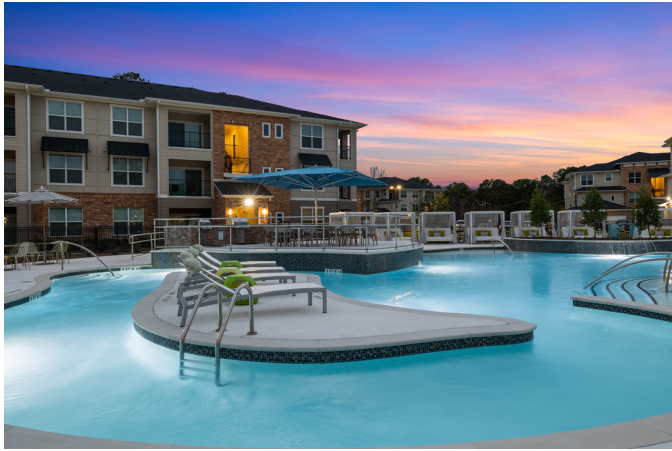
33 of 36