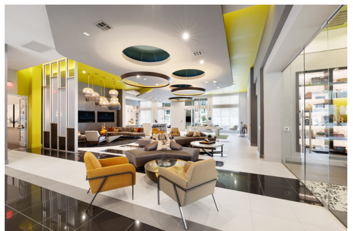
18 of 36