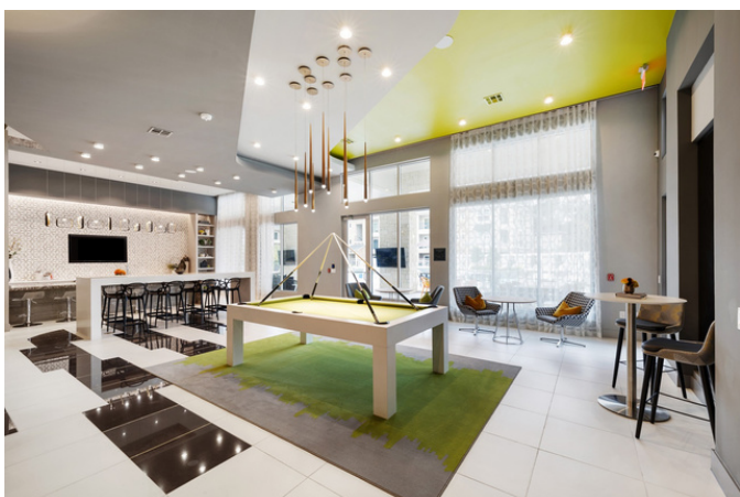
17 of 36