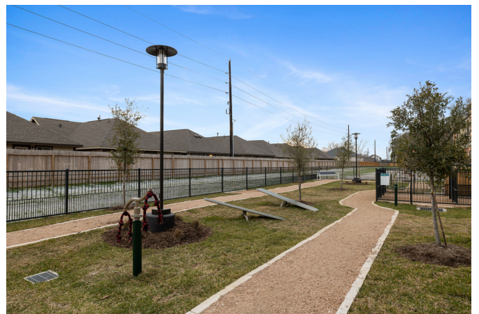
36 of 36