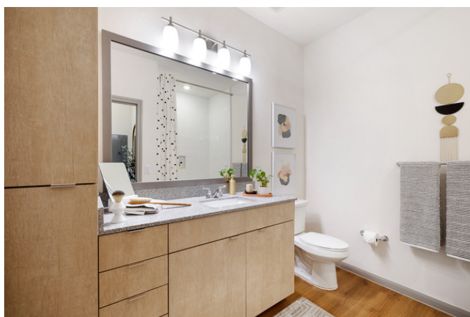
4 of 36