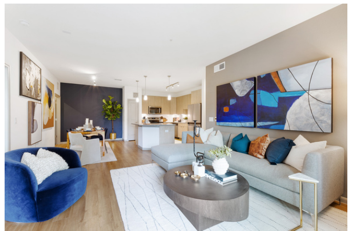
12 of 36