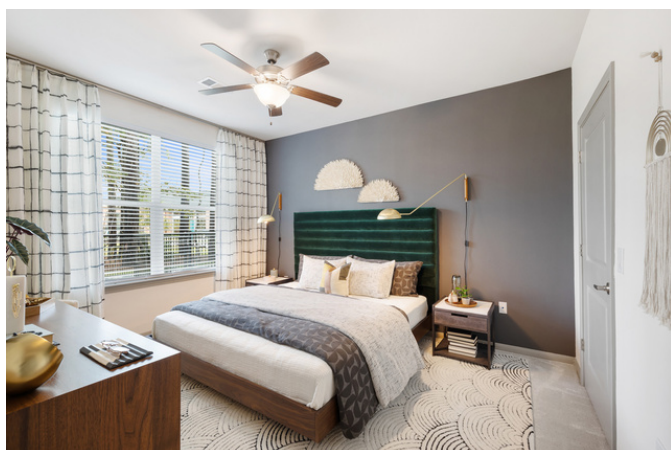
6 of 36