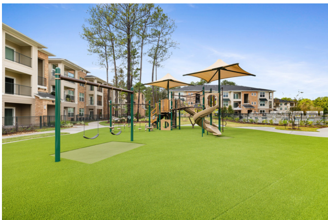
29 of 36