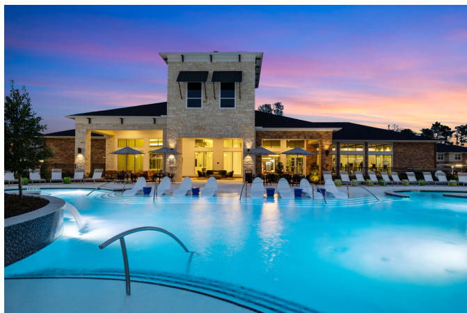
2 of 36