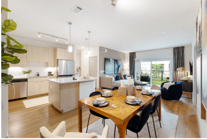
7 of 36