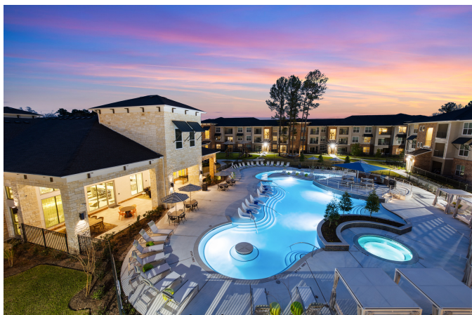
1 of 36