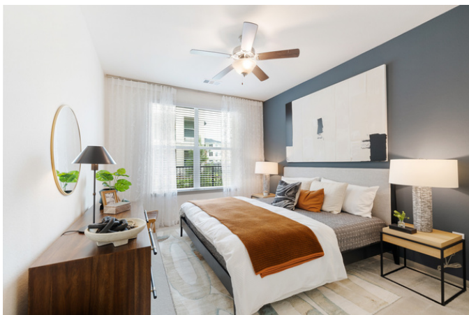
11 of 36