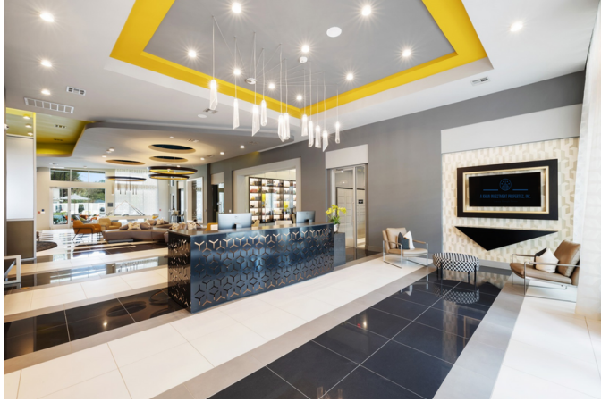
25 of 36