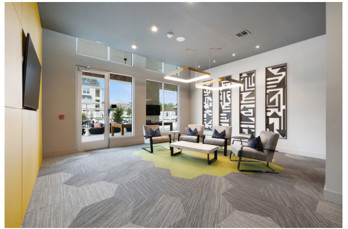
22 of 36